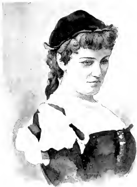
LILLIAN NORTON GOWER.